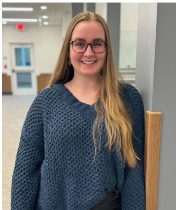
Brooke Volunteer Translator